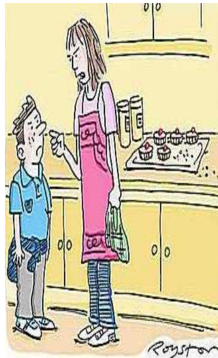
"I don't need to check anything with 'the boys in forensics', I know it was you."